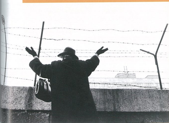
Source 6.9 A woman waves over the Berlin Wall, 1961

Locate an available wall in the classroom on which each group can display a summary of their findings. Be prepared to address the class in a three- to four-minute presentation about your Cold War episode. You might ask your teacher to research an episode not listed here.